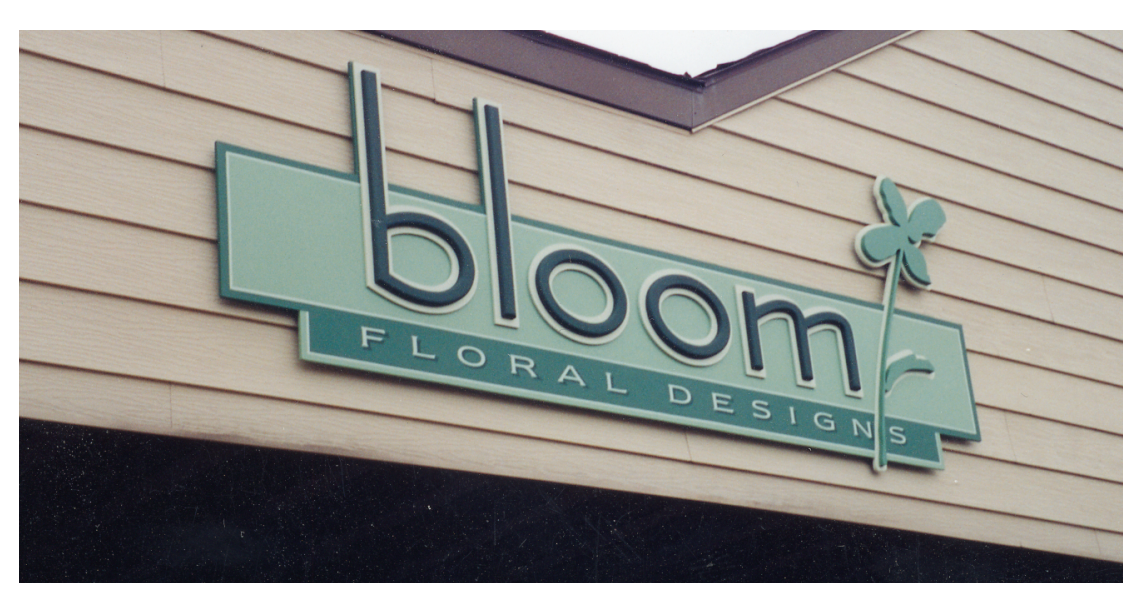
High-density urethane board on 4-by-10-ft. overlaid plywood panel, finished with acrylic latex paint