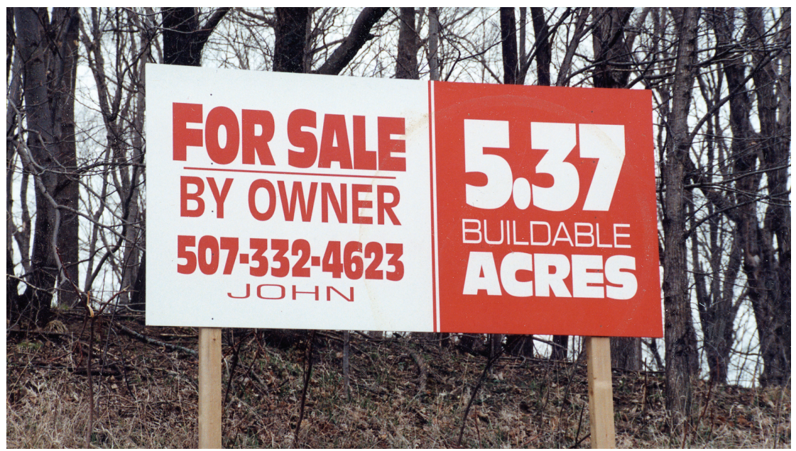
Enamel and vinyl on a 4-by-8-ft. panel of ½-in. overlaid plywood