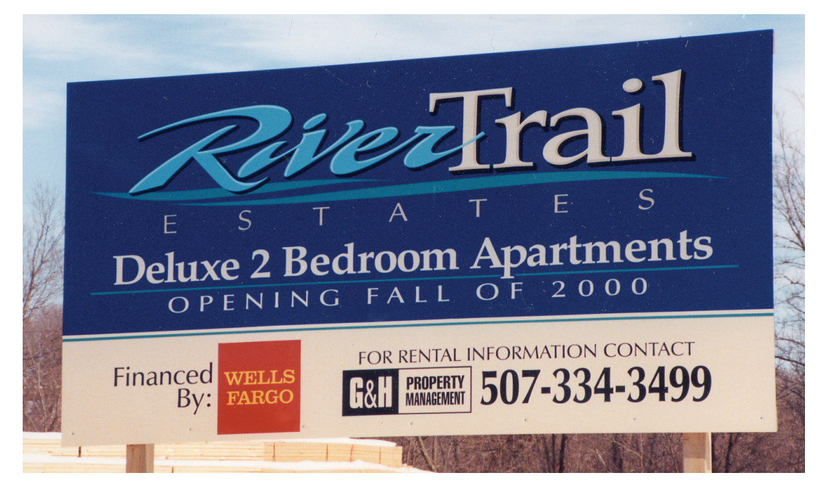
Enamel and vinyl on 5-by-10-ft. Alumalite® panel