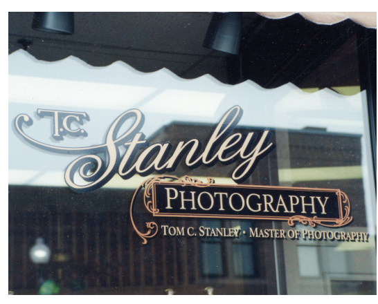
High-performance vinyl film