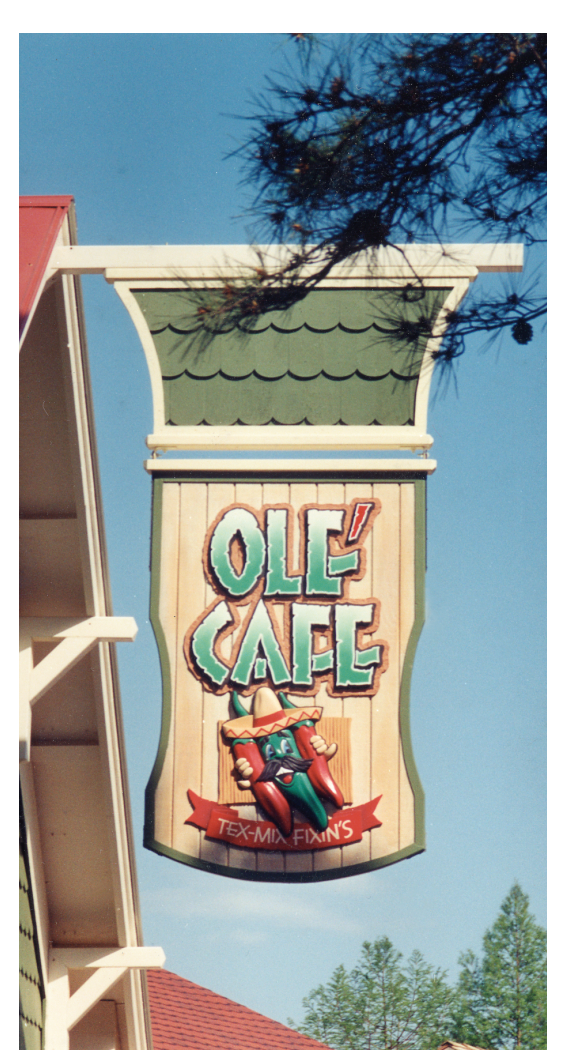
Enamel on 3-by-6-ft. cedar siding and panel, finished with acrylic latex paint; the carved peppers, cutout letters and banner are high-density urethane board

sign work—everything from overlaid plywood signs to trucks, walls, banners, dimensional signs and more. Always focusing on layout and design, Dave's sense of rhythm, color and legibility helps set his work apart. • $6