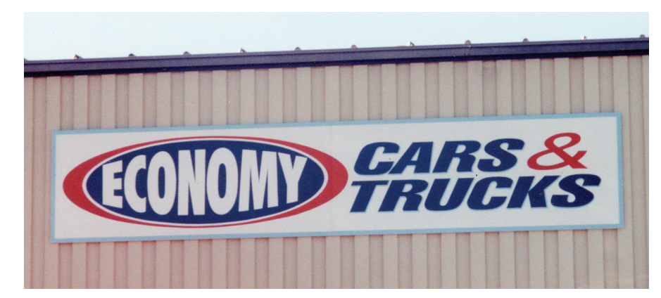
Enamel on 4-by-16-ft. Alumalite® panels