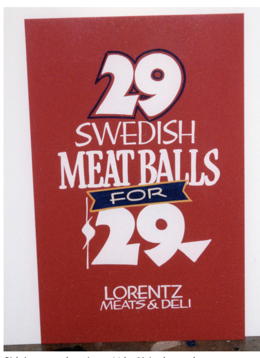
Rich Art watercolor paint on 14-by-22-in. showcard