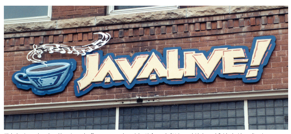
High-density urethane board lettering and coffee cup mounted on a 3-by-12-ft. panel of ½-in. overlaid plywood, finished with acrylic paint; cutout music notes are .080 aluminum