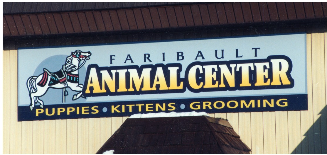
Enamel on a 4-by-16-ft. panel of 1/2-in overlaid plywood; Animal Center was masked and roller blended