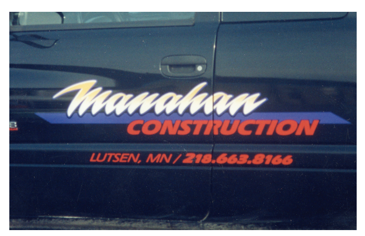
Createx ^{\rm IM} paint airbrushed on vinyl; highlight in \it Manahan was hand brushed after vinyl application