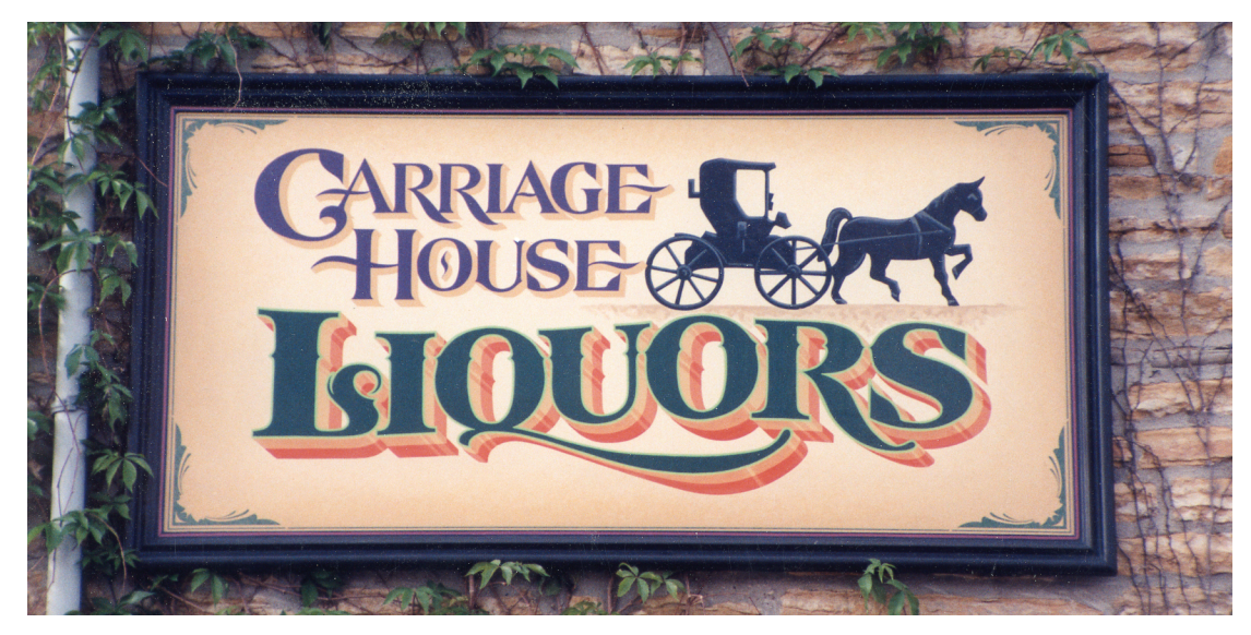
Enamel on 3-by-6-ft. overlaid plywood panel with pine frame