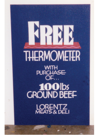
Rich Art watercolor paint on 14-by-22-in. showcard