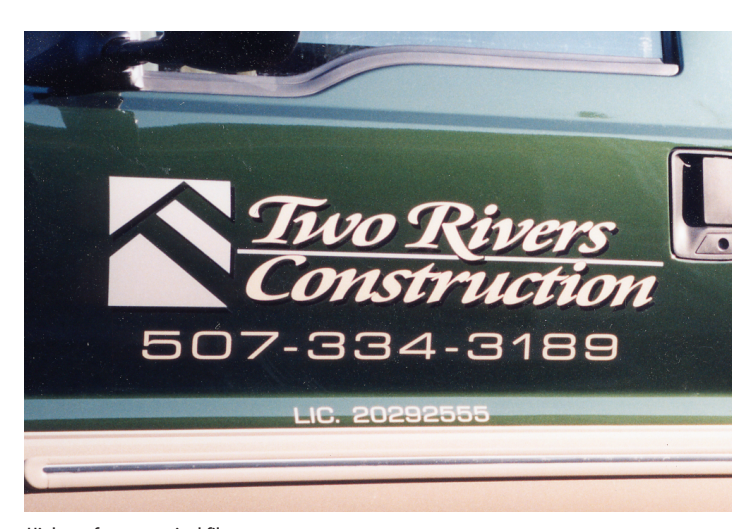
High-performance vinyl film