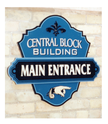
Vinyl lettering on <sup>3</sup>/<sub>4</sub>-in overlaid plywood panel, finished with acrylic latex paint; Main Entrance panel and carved hand are high-density urethane board