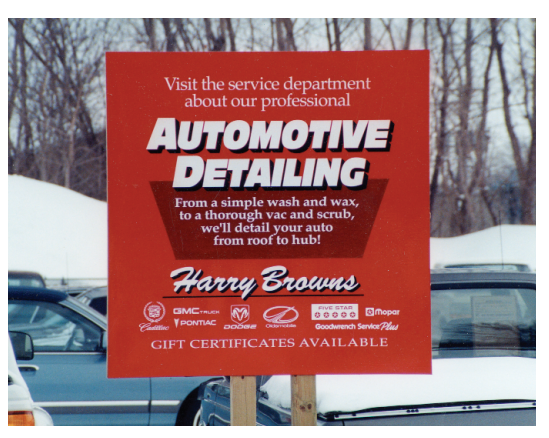
Vinyl lettering on a 3-by-4-ft. panel of ½-in. overlaid plywood