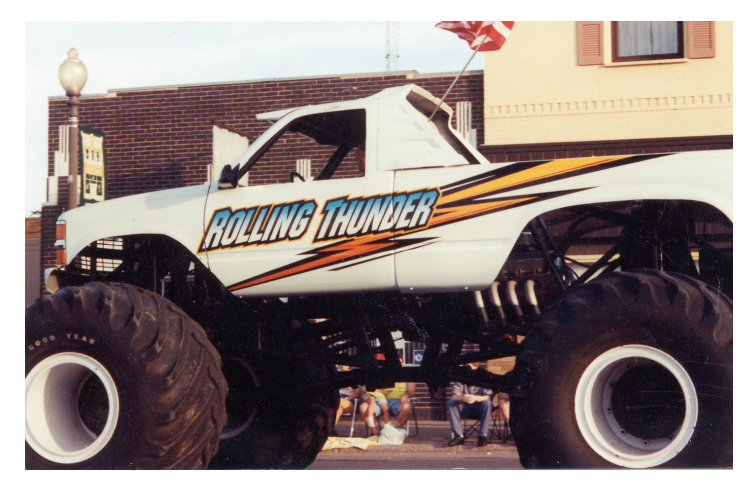
Enamel lettering and lightning were masked, airbrushed and then outlined