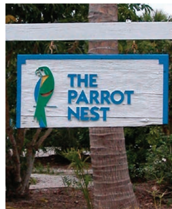
This sign, like others on the island, still shows the wrath of Hurricane Charlie.