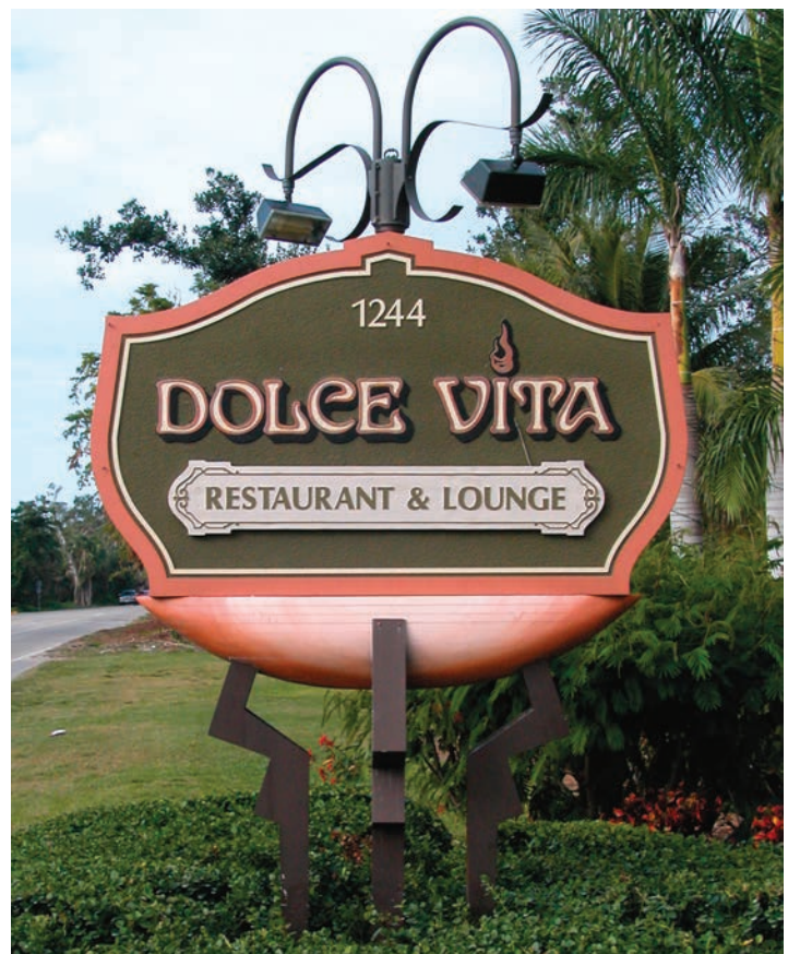
Island Designs, Ft. Myers, Florida