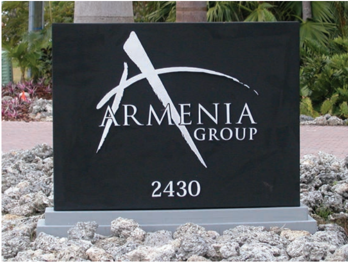
Island Designs, Ft. Myers, Florida