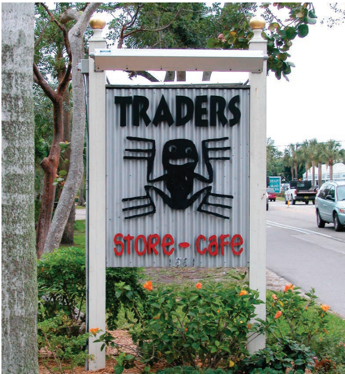
Landl Construction, Sanibel Island, Florida