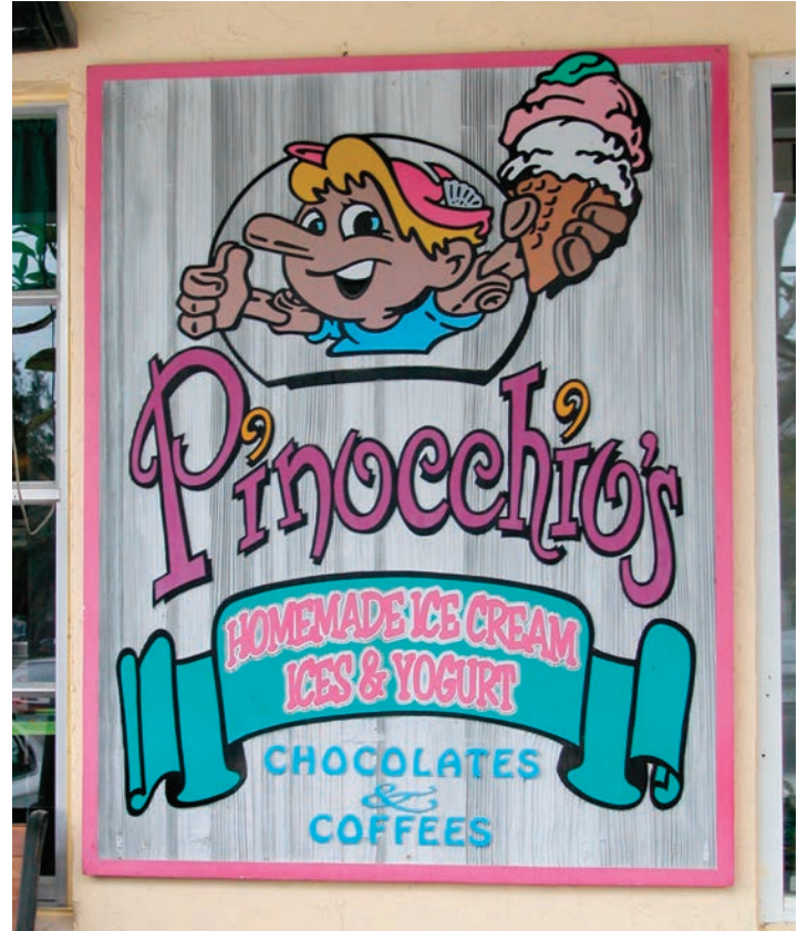
Sabel Signs, Ft. Myers, Florida