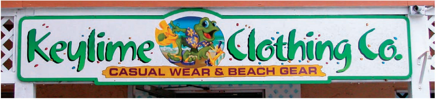
Sabel Signs, Ft. Myers, Florida