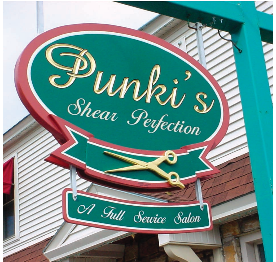
42-by-36-in. panel of 3/4-in. high density urethane board laminated to 1/2-in overlaid plywood. The aluminum brackets run all the way through the sign. Secondary sign is 1/2-in. overlaid plywood. Lettering is 23k gold leaf; paint is acrylic latex.