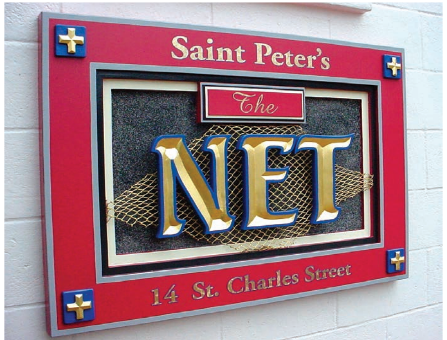
4-by-5-ft. vertical grain redwood sign. Lettering is 23k gold leaf; paint is acrylic latex.