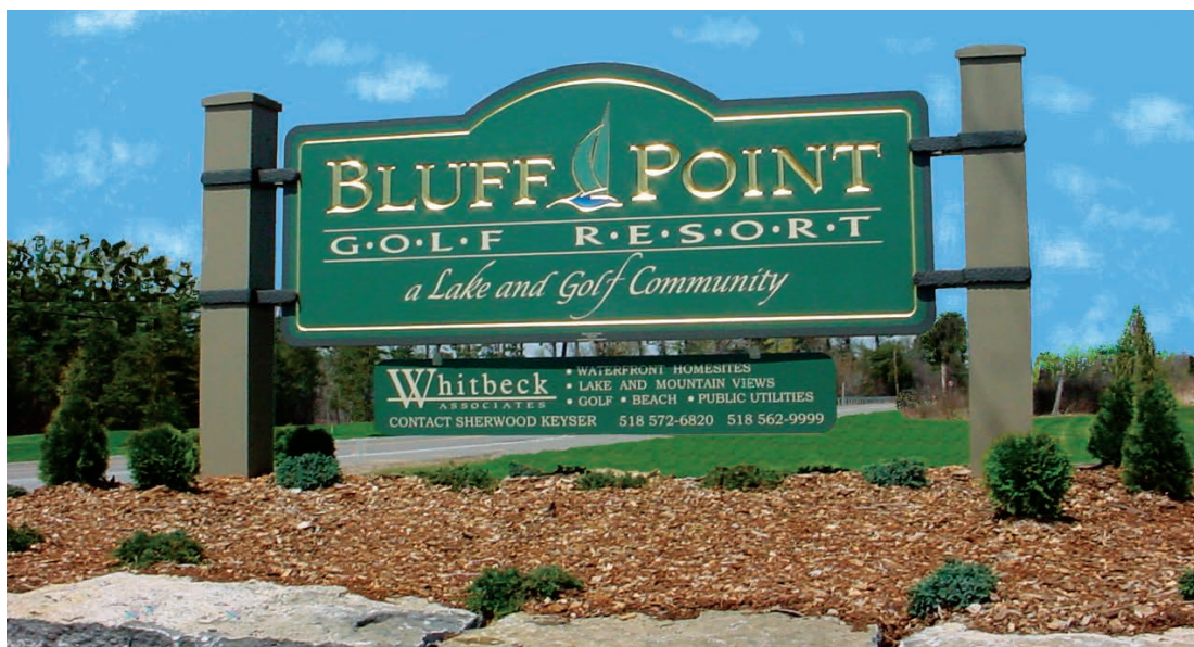
Double-faced 5-by-12 ft. sign made of two faces mounted to a 1½-by-2-in. aluminum box tubing truss. Sign faces are hand-carved ¾-in. high-density urethane board laminated with epoxy to ½-in. overlaid plywood. The 11-by-11-in. pressure-treated posts are skirted in overlaid plywood and painted with latex paint.