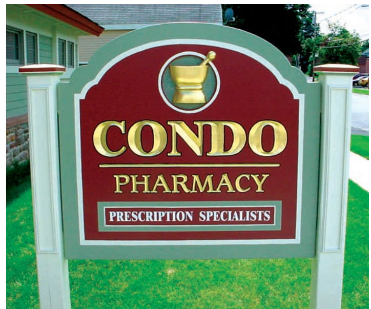
Double-faced 48-by-52-in. sign on 6-by-6-in. posts. The faces are hand carved 3/4-in HDU laminated with epoxy to 1/2-in. overlaid plywood. The background behind graphic is coarse white smalts “drowned” in dark green acrylic latex paint and Smith’s cream. The carved lettering is gilded.